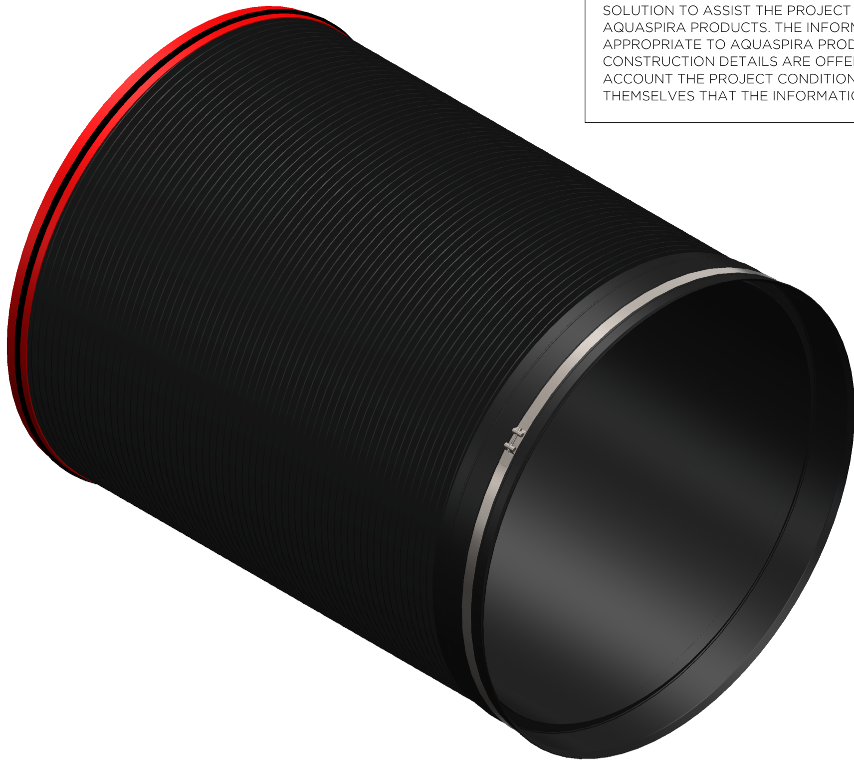
ISOMETRIC VIEW (SCALE 1:15)

NOTE: MANUFACTURING TOLERANCES ON ALL DIAMETERS TO ±6mm AND ALL LENGTHS TO ±50mm