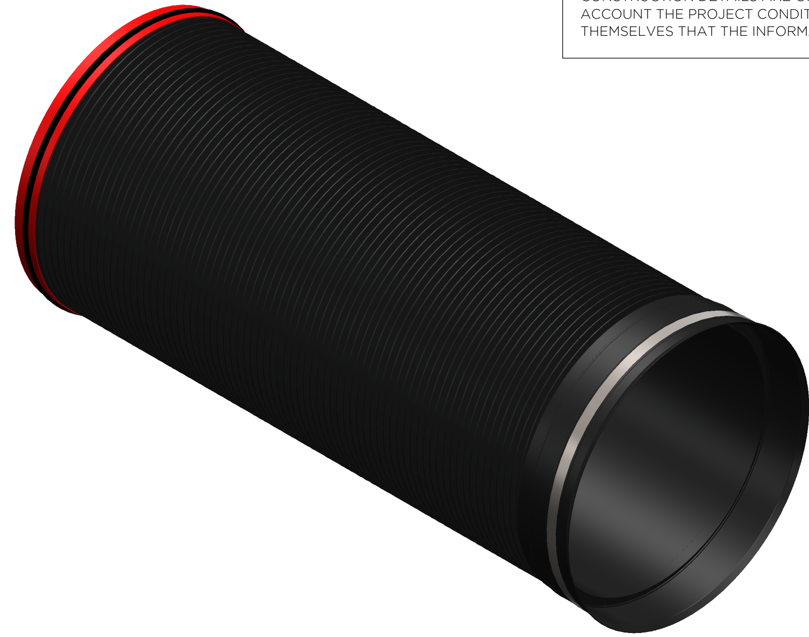
ISOMETRIC VIEW (SCALE 1:15)

NOTE: MANUFACTURING TOLERANCES ON ALL DIAMETERS TO ±6mm AND ALL LENGTHS TO ±50mm