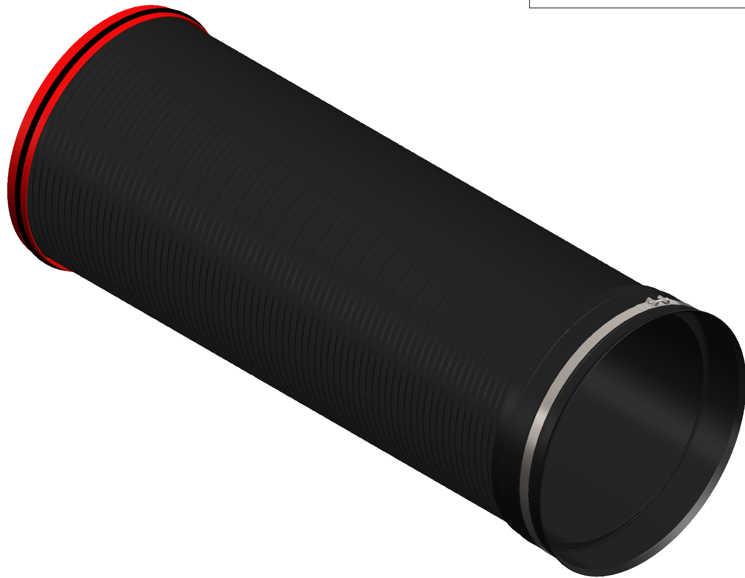
ISOMETRIC VIEW (SCALE 1:15)

NOTE: MANUFACTURING TOLERANCES ON ALL DIAMETERS TO ±6mm AND ALL LENGTHS TO ±50mm