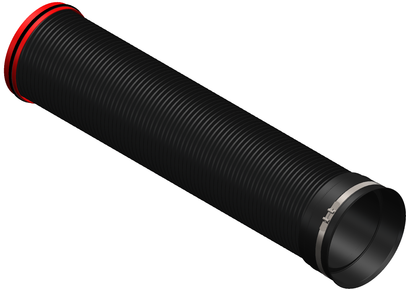
ISOMETRIC VIEW (SCALE 1:15)

NOTE: MANUFACTURING TOLERANCES ON ALL DIAMETERS TO ±6mm AND ALL LENGTHS TO ±50mm